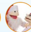
Puppet Theatre & Story Telling